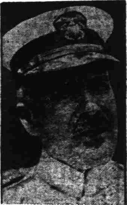
Admiral William V. Pratt, commander-in-chief of the U. S. fleet and chief naval adviser with the American delegation to the London naval parley, is slated to become chief of naval operations when Admiral Charles F. Hughes retires from that post on October 14.