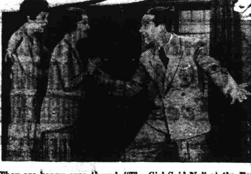
They are happy even though "The Girl Said No" at the Fox Elsinore today and Monday.

The story is based, so the report goes, on a real incident in the life of the wild-west Texan