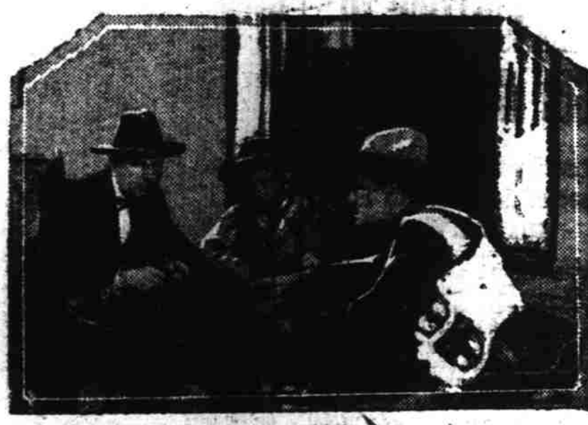
Action and plenty of it in "The Fighting Legion" a Ken May-nard production at the Hollywood today.