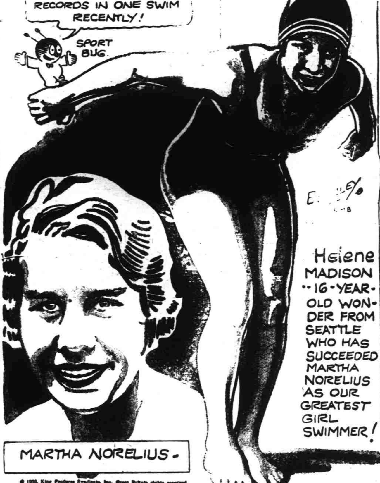
HELENE BROKE 6 WORLD RECORDS IN ONE SWIM RECENTLY!

MARtha NORELIUS—16-YEAR-OLD WONDER FROM SEATTLE WHO HAS SUCCEEDED MARtha NORELIUS AS OUR GREATEST GIRL SWIMMER! Miss Madison's immortal 500-yard swim broke four records previously held by Martha Norelius, who turned professional more than a year ago. Helene's feats seem to have definitely marked the eclipse of the marvelous Martha, something which is highly pleasing to red-hot amateurs, who were so shocked when Miss Norelius decided to swim for money rather than medals.