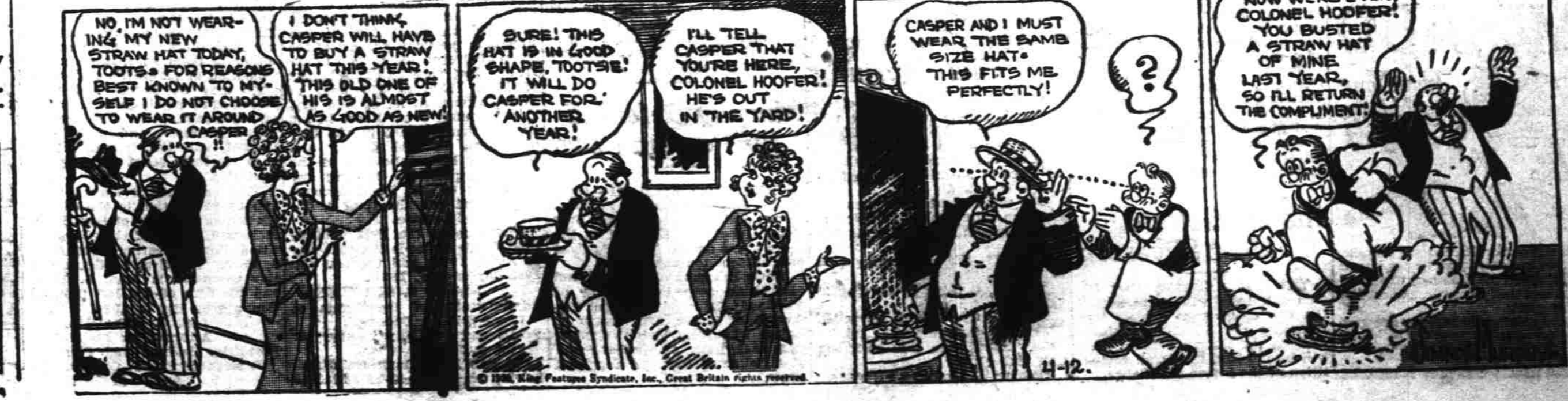
"A Returned Compliment"