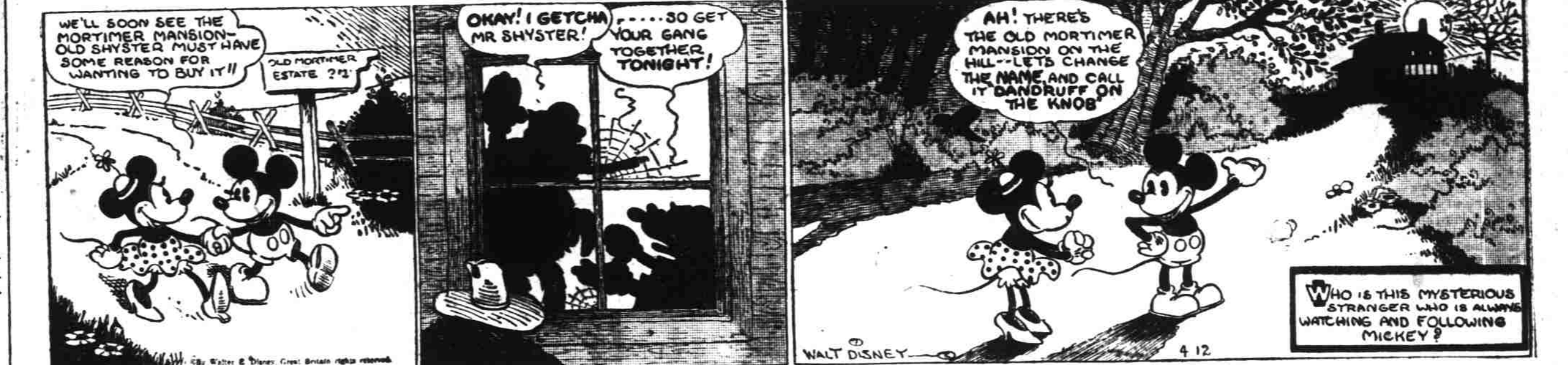
"The 'hair-ess' of Dandruff"