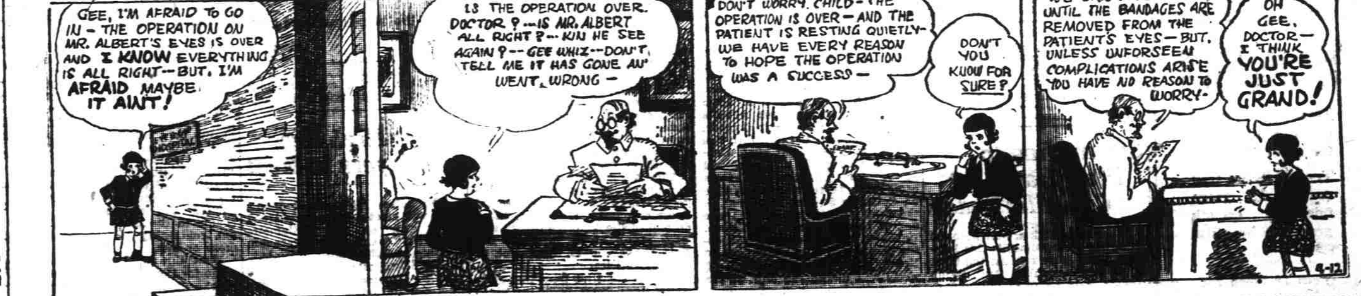
"The Doctor's Report"