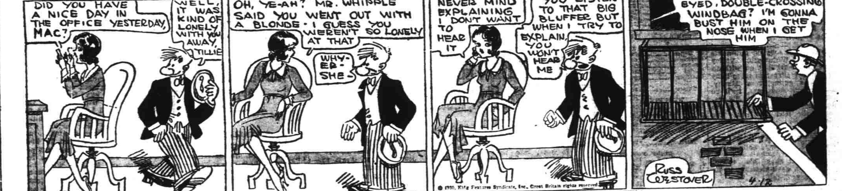
"The Ladder of 'Sock-cess'"