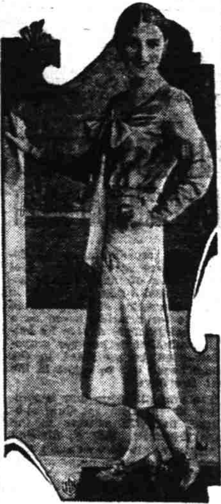
Spring is here. As evidence of the last of Winter, see the pretty semi-sports dress pictured above. It is of beige wool crepe, belted model at natural waistline. In perfect harmony with this ideal sports dress are the beige clare shoes with reptile trim.