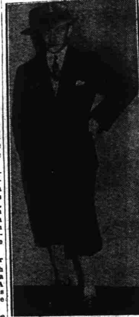
For wear in the country or on the golf links, Conrad Nagel, popular M-G-M star and considered one of the best dressed stars of the screen, suggests this outfit.

This spring the English type of slightly more pointed toe has come to the fore. These, if styled