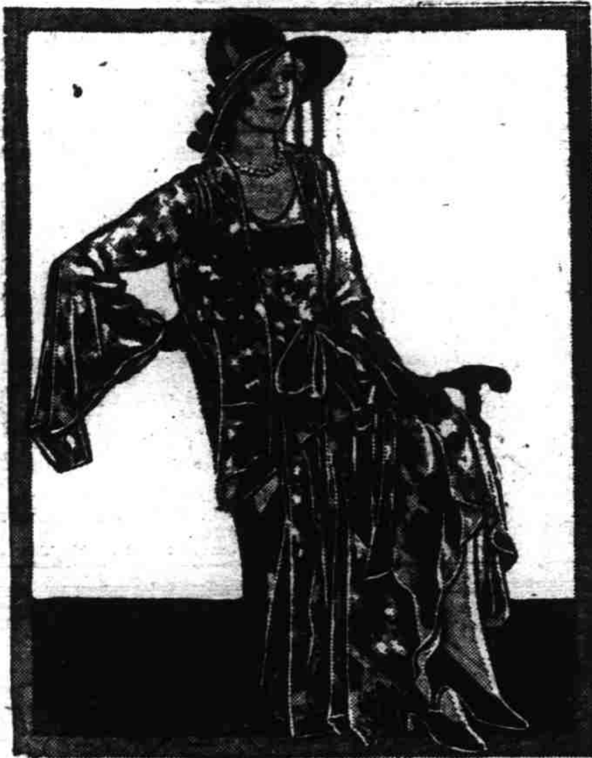
Length, grace and charm combine in the new dress demands for spring. Milady finds styles radically reversed but pleasantly so, in spring, 1930.