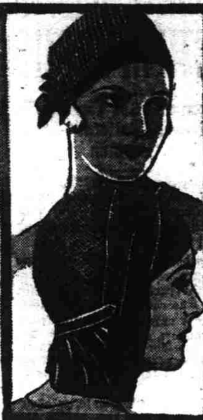
A little "kick up" effect over the left eye is one of the smart features of the new styles.