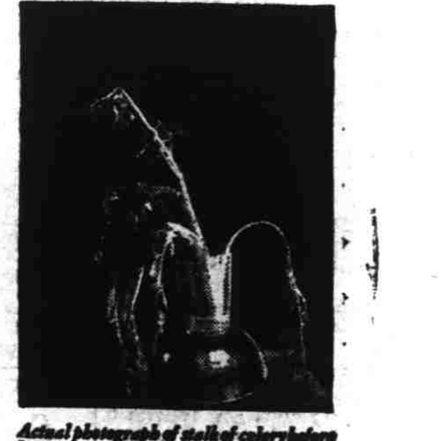
Actual photograph of stalk of celery before being placed in the Hydrator. The celery is tough, unpalatable, unclean.

Fast freezing exhibition The latest household cabinets in gleaming Porcelain-on-steel will be on display. The famous "Frigidaire Cold Control" will also be demonstrated. You will be shown how this device freezes ice faster—how it permits you to make scores of unusual desserts that require extreme cold. Free dessert and salad recipe books And we'll give you an opportunity to taste the better dishes made possible by the Hydrator and the "Cold Control." A cooking expert will prepare and serve unusual salads and frozen desserts during the entire period of the demonstration. And we've arranged to distribute two souvenir recipe books.