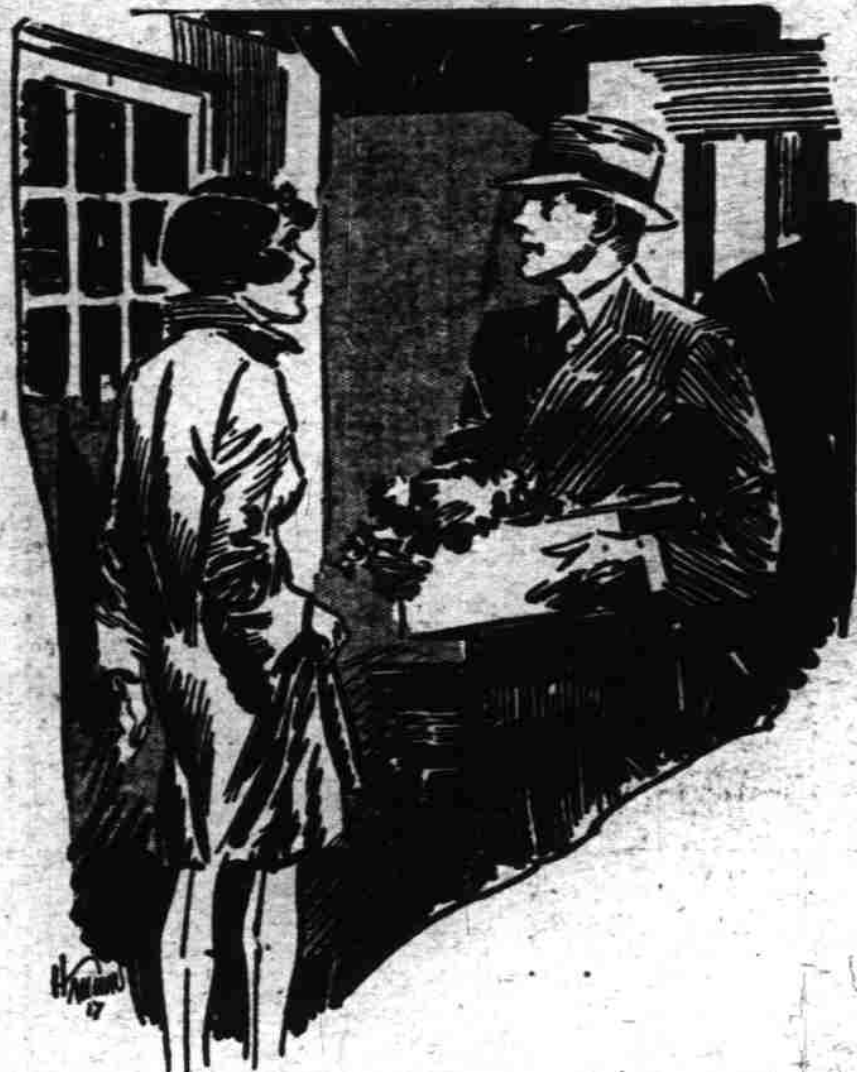
"Get your things on, Eve. I phoned the parson over at Noel City."

grin, Uncle Mat giving the bride away—all the lovely dreams vanishing. "He said no more, but as the weeks went along Eve could see he was disturbed. He spent a great deal of time at the Stewarts' and the editor of "Sky Lines," the magazine for which he did most of his work, began to hither. For Ken, always late with his pictures, now would go for days without touching brush or crayon. Mary finally told Eve that she ought to do something about it. "After all you're going to think of his welfare, dear. He's an overgrown child, really, but you're taking him as he is. I'm afraid life won't be easy for you. Still that won't matter if you love him enough." "Oh, I do! But my beautiful wedding—well—"