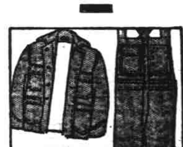
Pioneer Overalls Reduced

Ward's Six Months Work Shoes are the very best quality leather and are guaranteed to give at least six months' service.