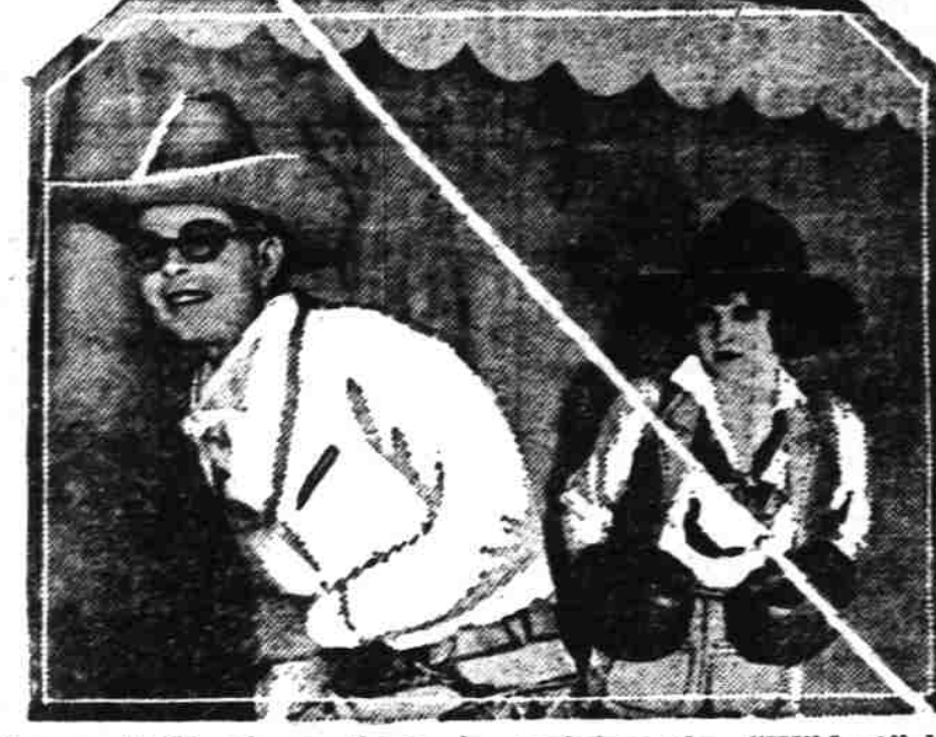
Some of "Hoot's methods in training the "Wildcat" into form, now showing at the Hollywood theatre.

The Chicago stock exchange is 63 members who are permitda trading privileges.