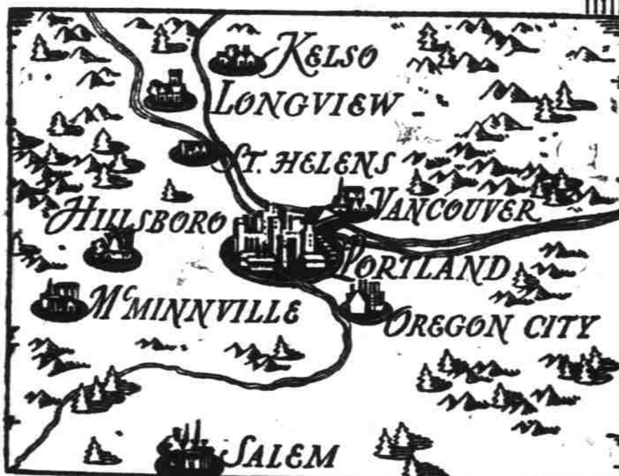
Nowhere on the Pacific Coast are motorists so fortunate as here. A big factory in Portland produces a limited supply of benzol—enough to make Gasco for these cities. It is impossible to get enough precious benzol to supply car owners generally