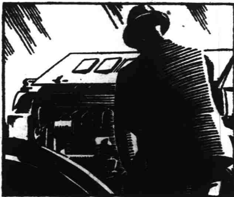
If you expect to use Gasco regularly, thin the carburetor mixture. Gasco can burn a larger proportion of air than gasoline can. Thus you'll save still more fuel—as much as 20% to 25% in some cases!