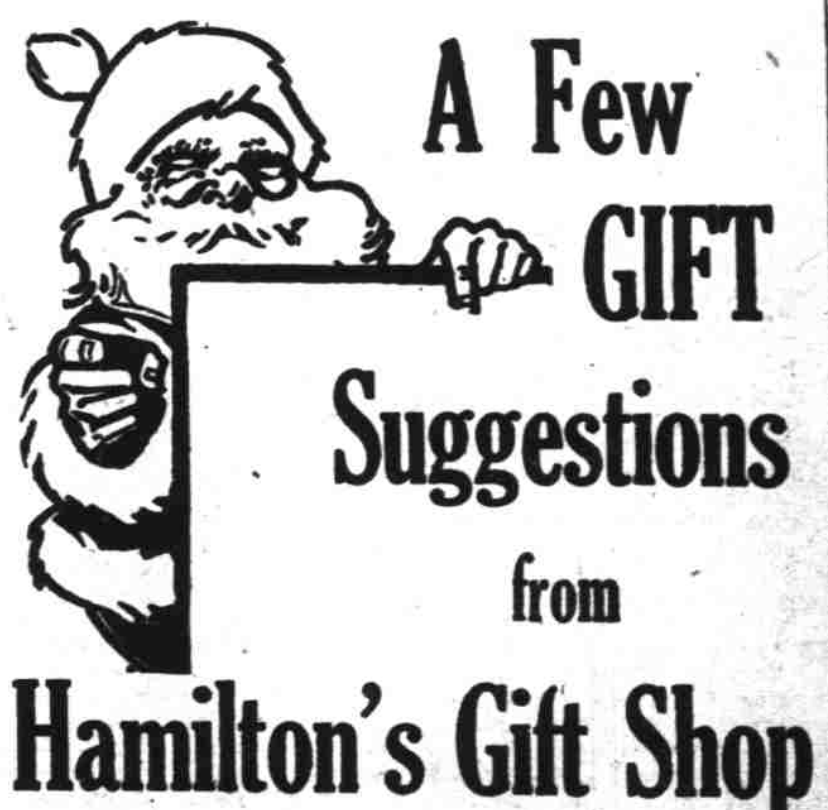
Table Lamps, Bridge Lamps, and Floor Lamps and Oriental Night Lamps and Incense Burners

1610 N. Summer Street "Buy Something for The Home"