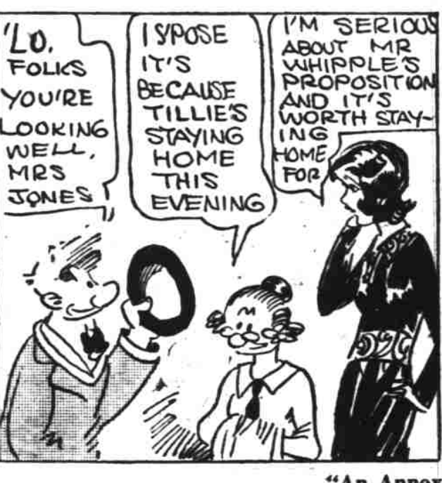
"An Annoying Stranger"