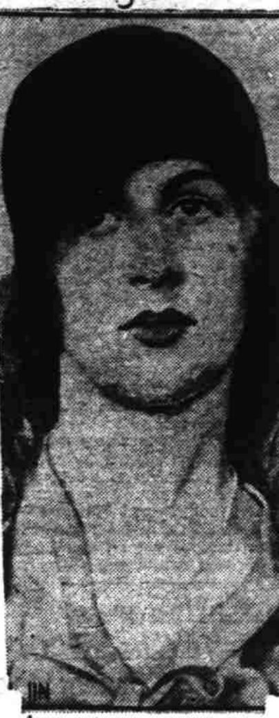
Miss Elizabeth Morrow, daughter of the United States Ambassador to Mexico, and sister-in-law of Colonel Lindbergh, who has confided to friends here that she expects to teach English to fifth grade pupils in a Mexico City public school this fall.