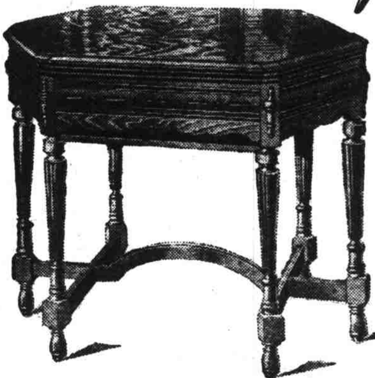
Looks Like This When Playing