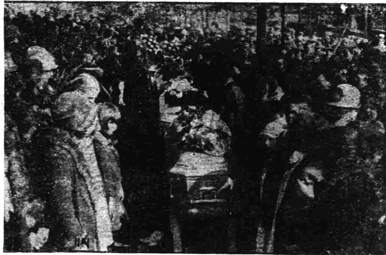
Funeral of the four Marion, N. C., strikers who were killed during the recent disorders in that city when the Sheriff and his deputies are alleged to have fired into a crowd of union workers.

during the winter months. In addition some stocks of the 1928 California crop are still on hand in France. Very little interest is therefore being displayed for new crop American prunes. Prices quoted in France on Yugoslav prunes are high and the demand is light.