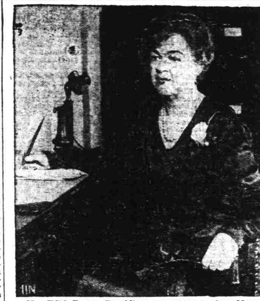
Mrs. Edith Rogers, Republican congresswoman from Massachusetts, had the signal honor of being the first woman speaker of the House of Representatives, when she received written authorization from Speaker Longworth to preside pro-tem in his absence.

plan and a ring with small blue set. She does not appear well educated and frequently says "I seen." She works her game through employing hosiery agents in each town she visits, getting these agents to secure a deposit on orders which are never delivered. The Lewis Hones company and All Silk Hosiery Mills are among company names used.