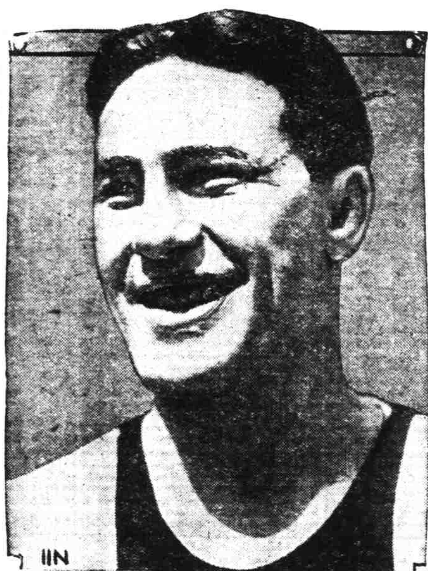
Jack Sharkey, above, last night defeated Tommy Loughran, below, by a technical knockout in the third round of their scheduled 15 round bout.