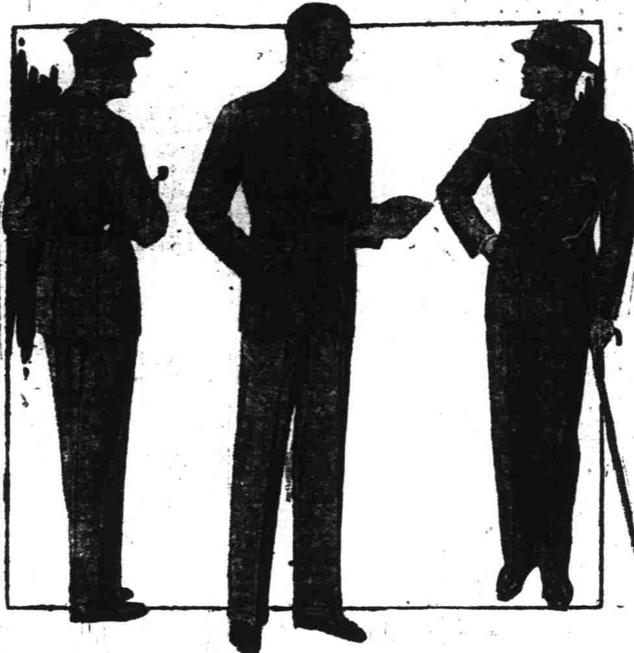
Shoulders are a trifle more broad; English fabrics are featured in new clothes.