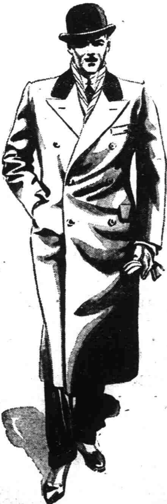
this coat as we feature it is spare, trim and devoid of affectations . . . shoulders wide and square . . . body moulding the natural contours of back, chest and waist.

summer wear with beaches for backgrounds has faded from the picture . . . and now the modern man of autumn attire comes to the fore.