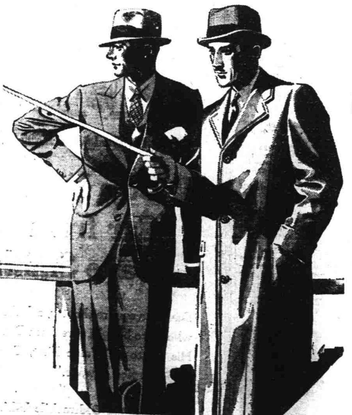
stylish and fashionable is the combination featured above . . . a kind of garb that men seriously prefer to be associated with.

as alluring as the carrot to the rabbit is the double breasted coat and black bowler on the left, and the single breasted top coat and suit combination on the right . . . chosen as an illustration of our service to men.