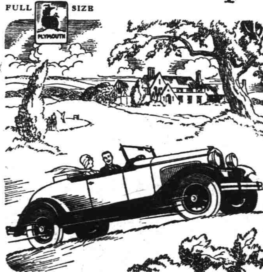
FULL-SIZE PLYMOUTH ROADSTER (with rumble seat), $675