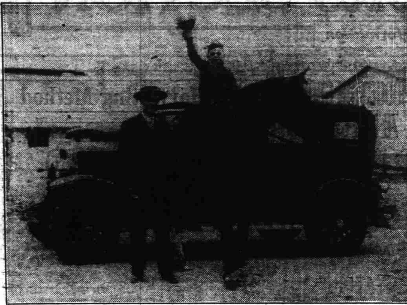
When United States Senator Arthur Capper was a little lad, he too was a cowboy. At least that is what he told this young cowpuncher who performed for the noted Kansas during the latter's visit to a Northern California farm last week. Among the Western producers to receive the praise of the famous farm bloc leader is the Durant Motor Company of California, manufacturer of the Durant Six Sixty-Six, shown in the background.