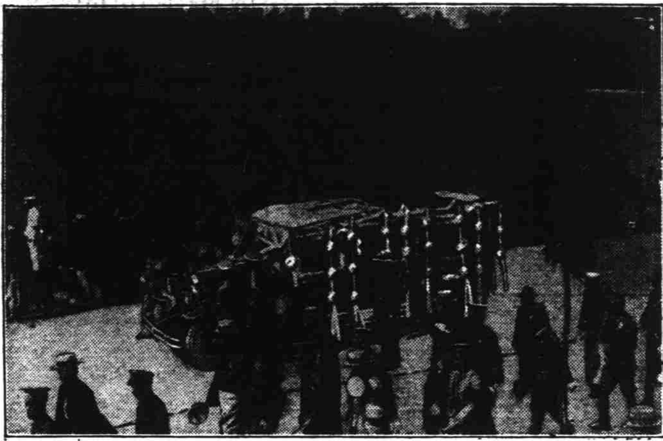
For centuries before the death of Dr. Sun Yat Sen, China's great men have been borne to their final resting places on the shoulders of worshipful coolies. It was little less than revolutionary when the revolutionaries of the Chinese Republic and founder of Communistism, make his way over a newly laid concrete highway to the sacred mountain with a Nash "400" funeral car bearing the body of their late leader. The picture shows the special Nash funeral car, covered with symbolical Chinese funeral decorations, proceeding to the mountain services. Diplomatic representatives from some nineteen countries joined Chinese officials in paying their respects to Dr. Sen's memory.

the detour and the road is in excellent condition throughout.