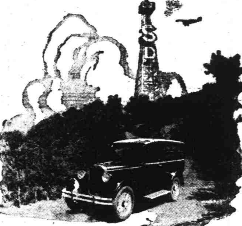
Giant beacons that furnish the eyes for night fliers in the west are serviced by this type of Dodge Brothers truck. Dependable performance is essential in maintaining this trail of lights that radiates for miles across the country. The trucks are owned by the government and operated by the Department of Commerce.

Motor Co., local Dodge Brothers dealer. "To meet the demands of present day motoring, new standards of performance and safety have been developed by engineers," said Mr. Bonesteel. "Typical of this, is the fact that the New Dodge Brothers Six was built to specifications designed to cope with all conditions encountered in heavy traffic. In this model, engineering skill has produced a car with: "Maximum flexibility and acceleration in traffic or away from signal lights. "A turning circle of small diameter for easy parking. "Four wheel, hydraulic, internal-expanding brakes that afford positive control. "Convenient controls requiring the minimum of effort in driving. "Mono-Piece body free from annoying squeaks and rattles. "Fuel economy that provides the greatest mileage possible when the engine is idling in traffic."