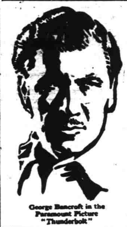
George Bancroft in the Paramount Picture "Thunderbolt"