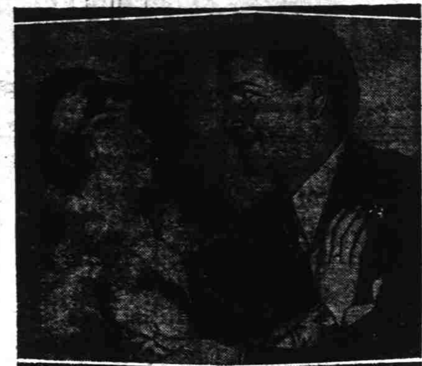
Fay Wray and George Bancroft in a scene from the Paramount picture "Thunderbolt," at the Elsinore beginning Thursday.