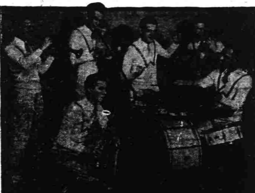
Fred Waring's Pennsylvanians, who put the sink in "Synco-pation," now showing at the Elsinore.