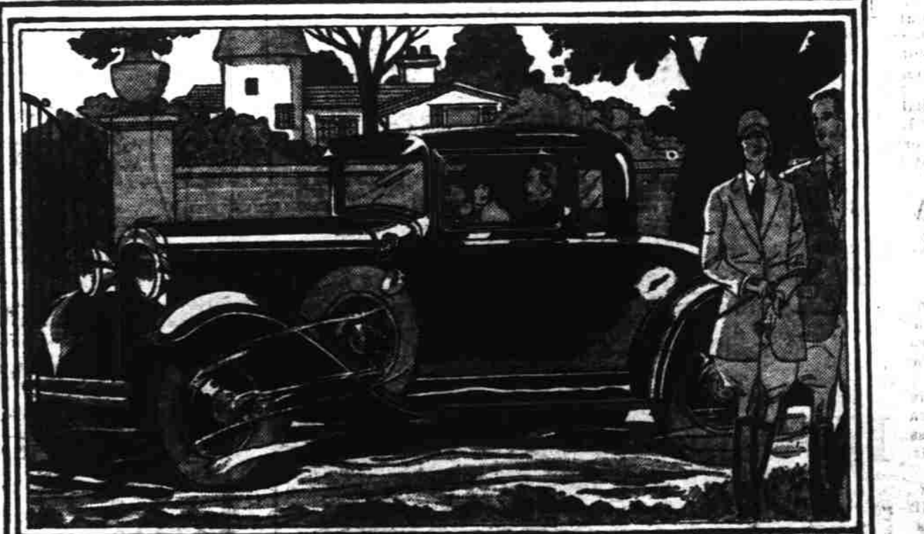
The new Dodge Motor pieces bodies are not only sleek proof, they're lovely to see! Here is the de luxe Coupe, with wire wheels.

In the new Dodge Six motor the combustion chambers are fully machined to make compression uniform. When the car maker takes so much care it seems shameful to use an oil that builds up rough layers of damaging, gritty carbon inside. You needn't use such an oil any more.