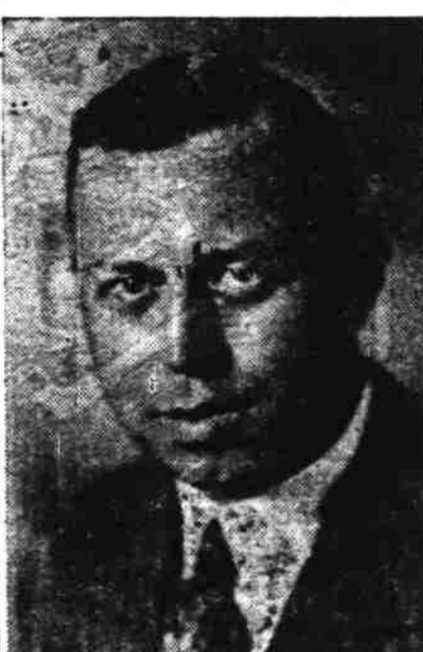
He is soon to open his new "Master" station on Commercial and Center street.

life should be watched as closely as that of thoroughbred horses, dogs or cattle. Hence the name, registered.