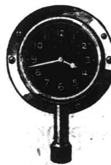
25 Cents obtains a beautiful DIAL AUTO CLOCK

COUPONS are given with Gasoline, Oil, Tires, Car Washing, Greasing or Tire Repairing