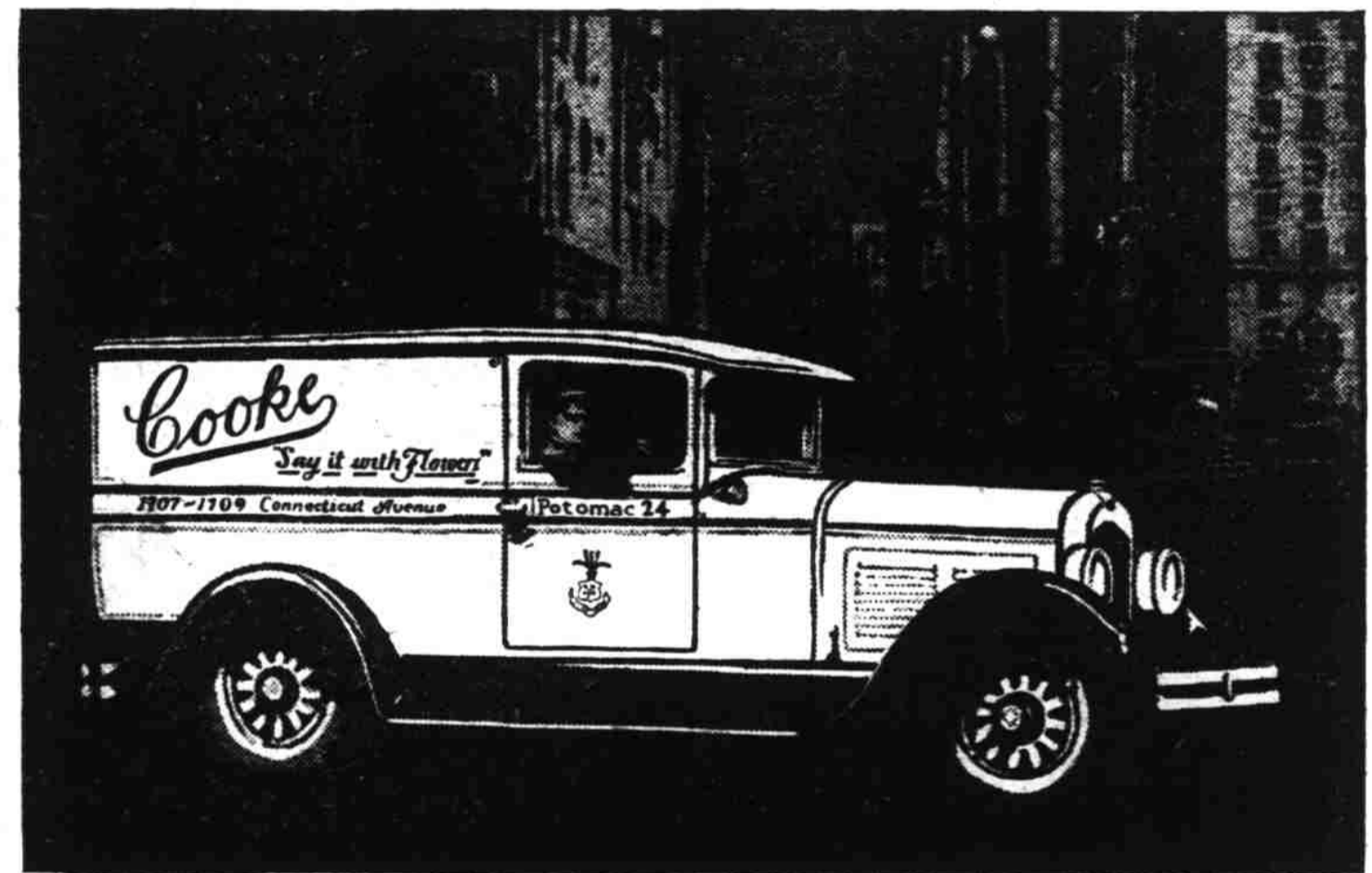
Reo Junior Speed Wagon in the Delivery Service of Cooke, Florist, of Washington, D. C.

Second-Class Delivery Means A Second-Class Business In The Public Mind. High-Class Delivery Means A High-Class Business To The Thousands Who See Your Trucks On The Street Every Day