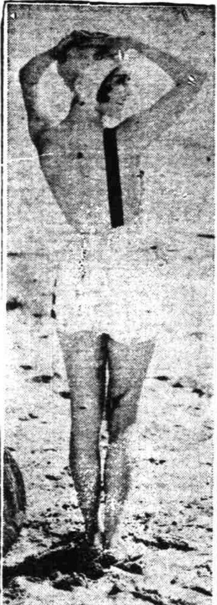
Dorothy Sebastian, screen star wears one of the first backless bathing suits seen on the Santa Monica, Cal., beach. She has chosen white, which accentuates her sand tanned skin with smart black trimmings.

the storm bound towns were requested to notify the newspapers. At the specified hours, high lights of the day's news, baseball scores and important state news were sent out over the air.