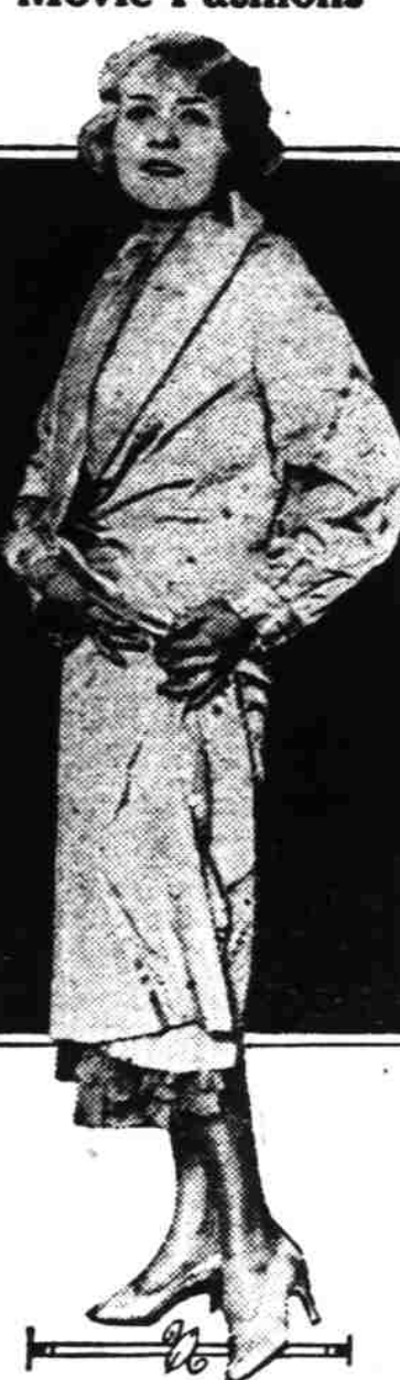
This simple and youthful evening wrap is fashioned of orchid taffeta, stitched and bound with silver. Eleanor Griffith, stage and screen star, enhances her beauty by wearing this wrap.