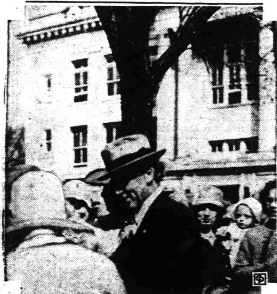
When Henry S. Johnston, impeached governor of Oklahoma, returned to his home at Perry, he told the assembled throng that he was "hijacked out of office" because he would not do the bidding of a "political gang." He has resumed his law practice and plans to seek the senatorial nomination next year. Above, he is surrounded by a part of the crowd.