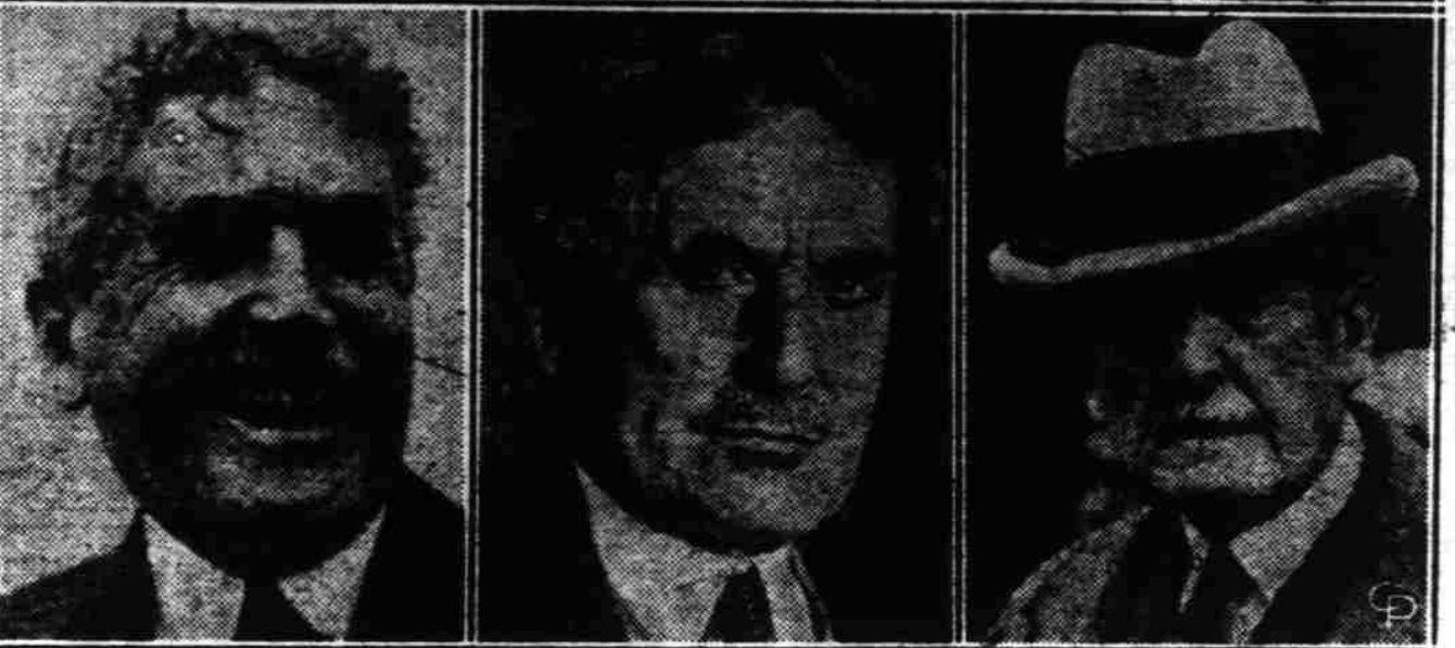
Here are a number of photos of Myron T. Herrick, United States ambassador to France, whose body will reach New York today. Left to right, top: Herrick in 1912, just after his appointment as ambassador; at the outbreak of the war in 1914; in 1918; center, with Col. Charles A. Lindbergh, left, and President Doumergue, of France, just after Lindy's transatlantic flight in 1927; below, in 1928; a recent picture, and one of his latest photos.