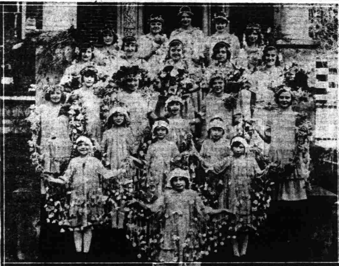
Young folk who will take part in the operetta 'Golden Hair and the Three Bears.'