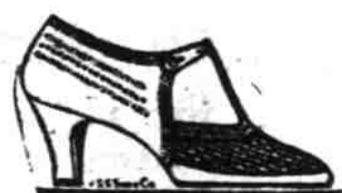
Tan and white vamp with quarter of Lido sand kid.

Outstanding this Spring are these sandal type pumps made by America's most skilled craftsmen. Lined with kid throughout. They are perfect fitting, dressy and smart. Suitable for wear at any function where formal evening attire is not required.