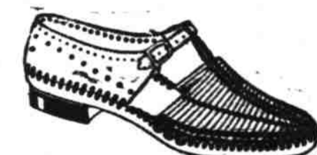
Children's and Misses Deauville sandals in two tone tan.

Imported from Czecho-Slovakia, these sandals reflect the very spirit of Spring. Suitable for both morning and afternoon wear, they harmonize with the new Spring mode for color. Made to complete and enhance the ensembles of blues, greens and the popular Spring black and white. Sun tan shoes to blend with sun tan legs and bring sunny smiles of comfort.