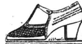
Beige and tan vamp with quarter of Lido sand kid, also in all black.

Outstanding this Spring are these sandal type pumps made by America's most skilled craftsmen. Lined with kid throughout. They are perfect fitting, dressy and smart. Suitable for wear at any function where formal evening attire is not required.