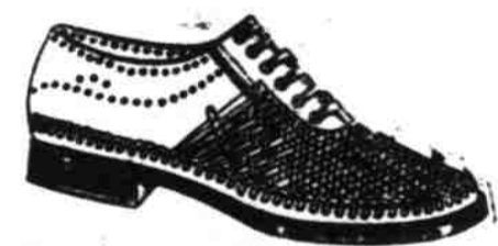
Men's Deauville Oxford in two tone tan with heavy stitch-down sole.

Imported from Czecho-Slovakia, these sandals reflect the very spirit of Spring. Suitable for both morning and afternoon wear, they harmonize with the new Spring mode for color. Made to complete and enhance the ensembles of blues, greens and the popular Spring black and white. Sun tan shoes to blend with sun tan legs and bring sunny smiles of comfort.