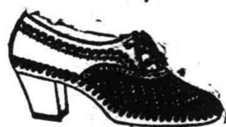
Tie pattern, in beige, white and blue and white.