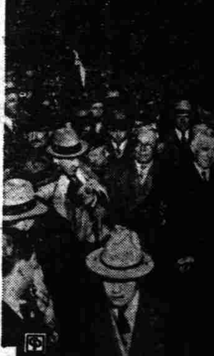
After 18 years in the senate James A. Reed, Missouri's fighting warrior, has returned to his home in Kansas City and private life. As he stepped from the train he was greeted by throngs of friends and a band, and tears dimmed his eyes as he accepted their tribute.