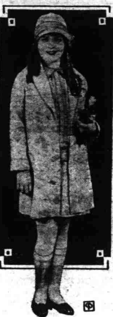
The coat and skirt of this junior three-piece ensemble are made of kasha in pastel shades. The blouse is pale tan. A natural straw hat completes the costume of bridge.