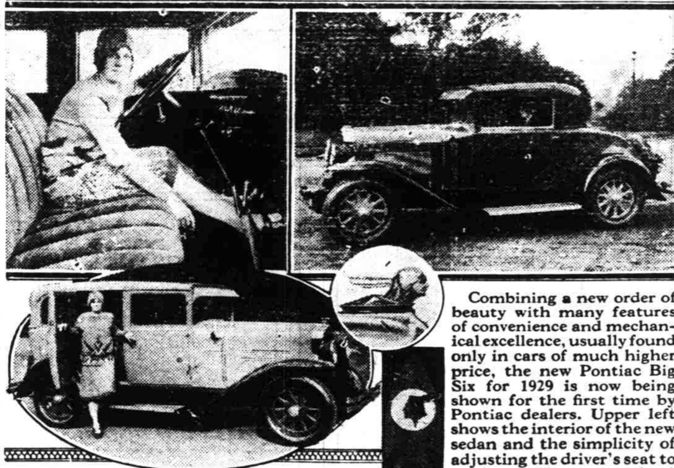
Combining a new order of beauty with many features of convenience and mechanical excellence, usually found only in cars of much higher price, the new Pontiac Big Six for 1929 is now being shown for the first time by Pontiac dealers. Upper left shows the interior of the new sedan and the simplicity of adjusting the driver's seat to conform with a person of any Fisher body; lower left, the 4-door sedan; upper right, the coupe with beautiful new cap and tire cover emblem.