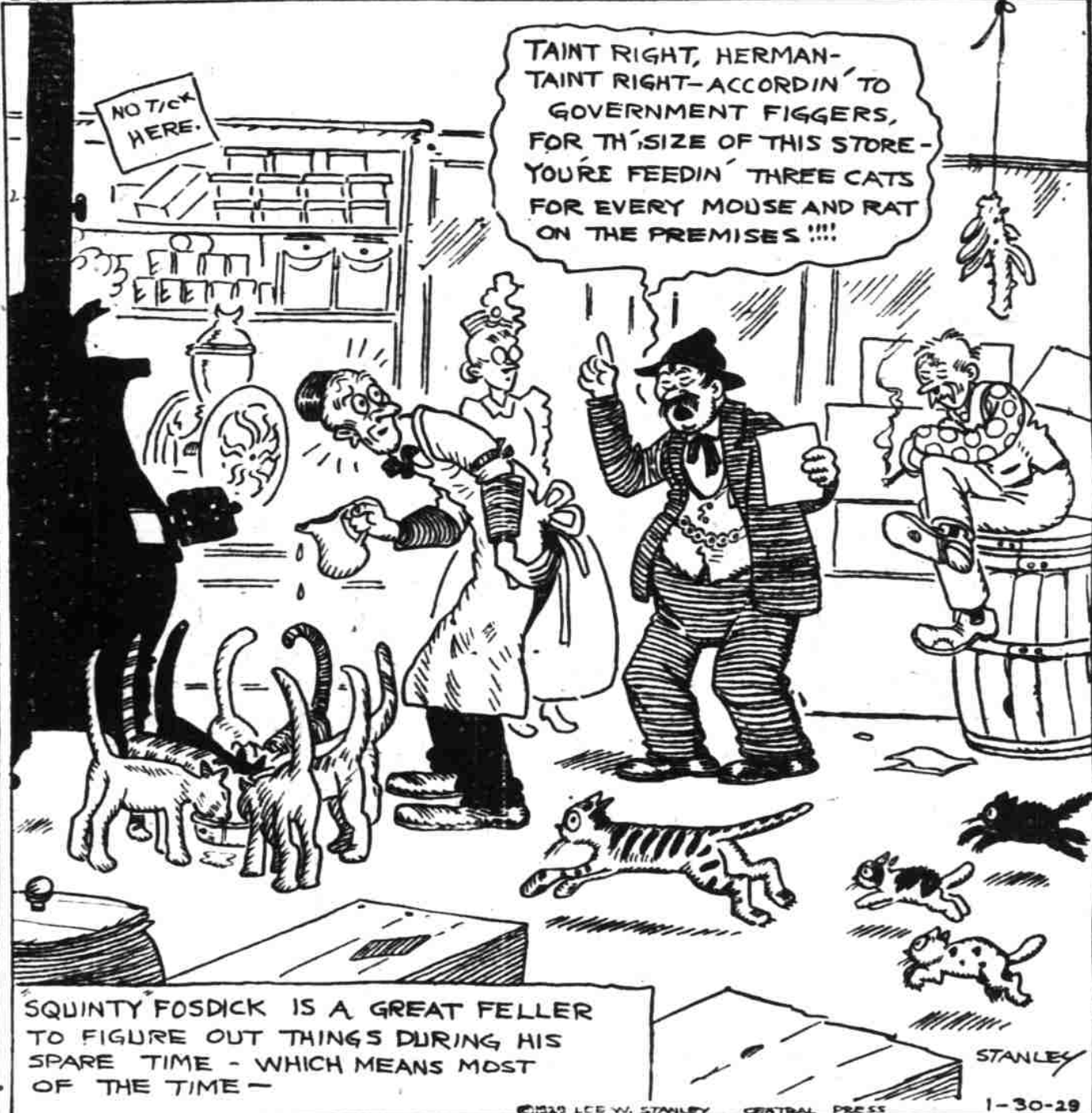
SQUINTY FOSDICK IS A GREAT FELLER TO FIGURE OUT THINGS DURING HIS SPARE TIME - WHICH MEANS MOST OF THE TIME -