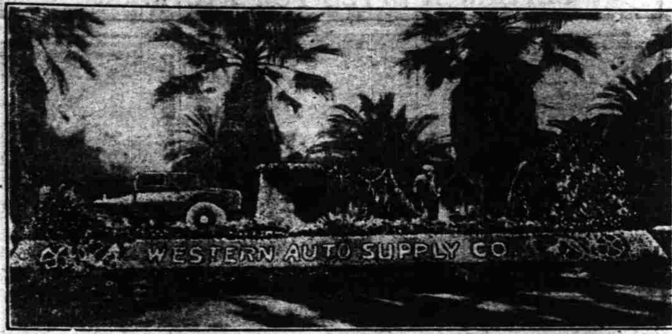
Illustrating in Sowers Edgar Guest's poem, "A Boy and His Dad on a Fishing Trip," the boat entered by the Western Auto Supply Company, won theme prize, the second highest award, in the Pasadena Tournament of Roses. A fishing scene with a boy and his dad was worked out effectively in Sowers. More than 150,000 blossoms were used in decorating the boat.

coast newspapermen who are in New York attending the automobile show. "These men already have made an outstanding success of one of America's most popular cars and the Durant Motor company of California will be stronger than ever because of the addition of these able executives to the personnel of Durant Motors, Inc. Advising our new executives will be a board of directors composed of managers of all the subsidiaries of Durant Motors, Inc. This board will include the heads of the Hayes-Hunt Body Corp., Warner Gear Co., New Process Gear company, and the American Plate Glass Co.