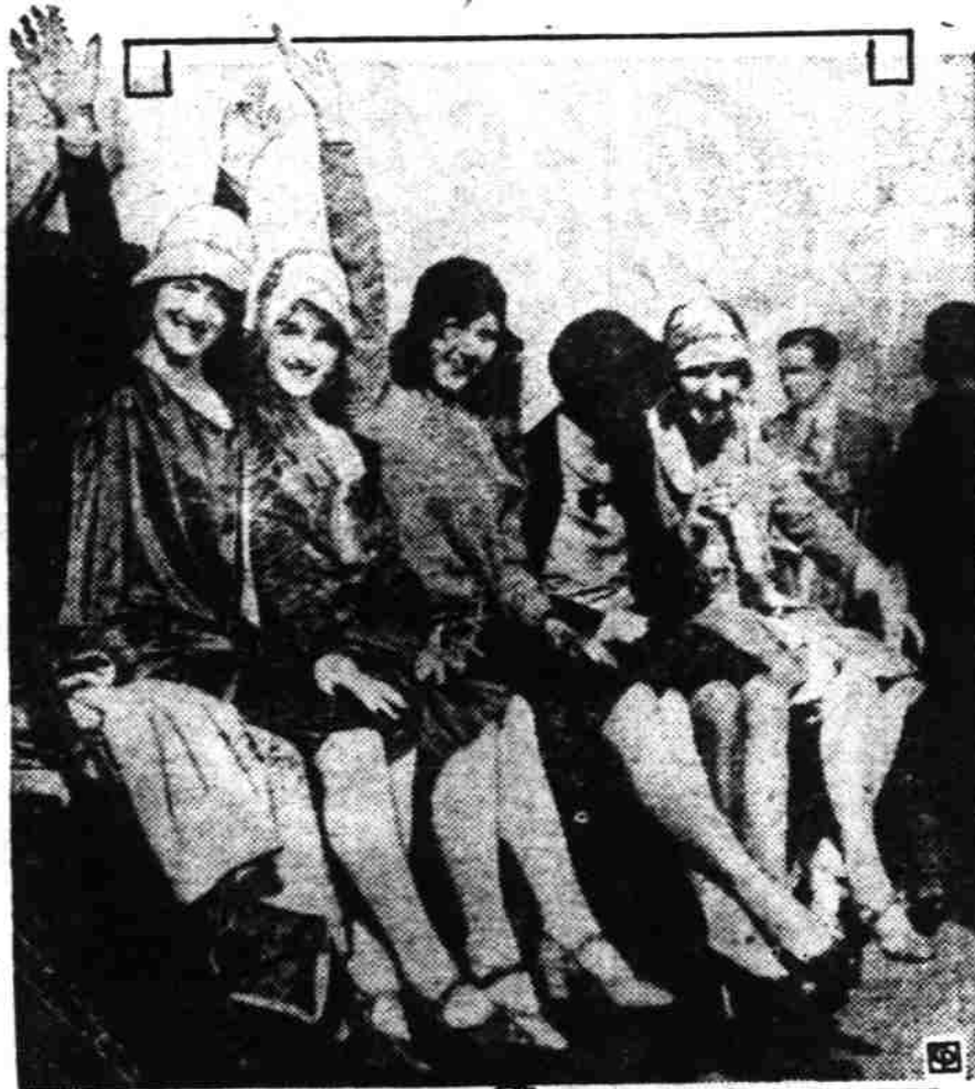
These co-eds are smiling because they don't have to go to school for six months—at least not on land. As students of a floating university they'll do their studying aboard an ocean liner on the high seas and in foreign ports. They receive a full year's college credit for their work. Fifty men and 50 women are enrolled. This photo was taken when the ship arrived at Los Angeles from New York.