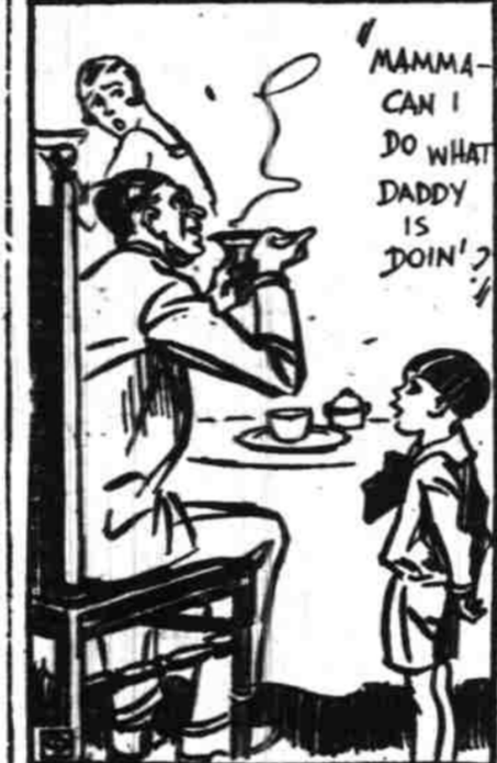
The best thing you can give a child is a good example.

The space devoted to classified ads in the New Statesman is continually being forecasted; the growth of these small want-ads is keeping pace with the expansion of the rest of the paper.