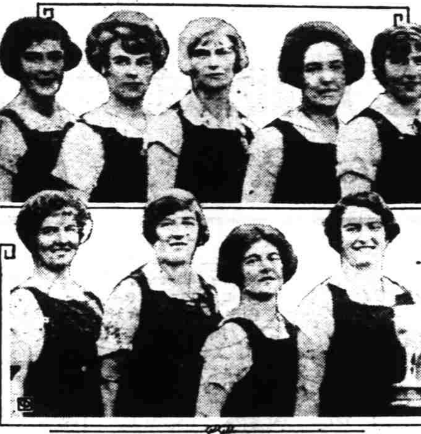
Here are the first basketball champions of the 1928-1929 net season. These girls, members of the Auckland, New Zealand, championship girls' team, defeated every other first-rate girls' team in the country. They won their title weeks before the American season opens, because the New Zealand winter season ends when the North American season begins.