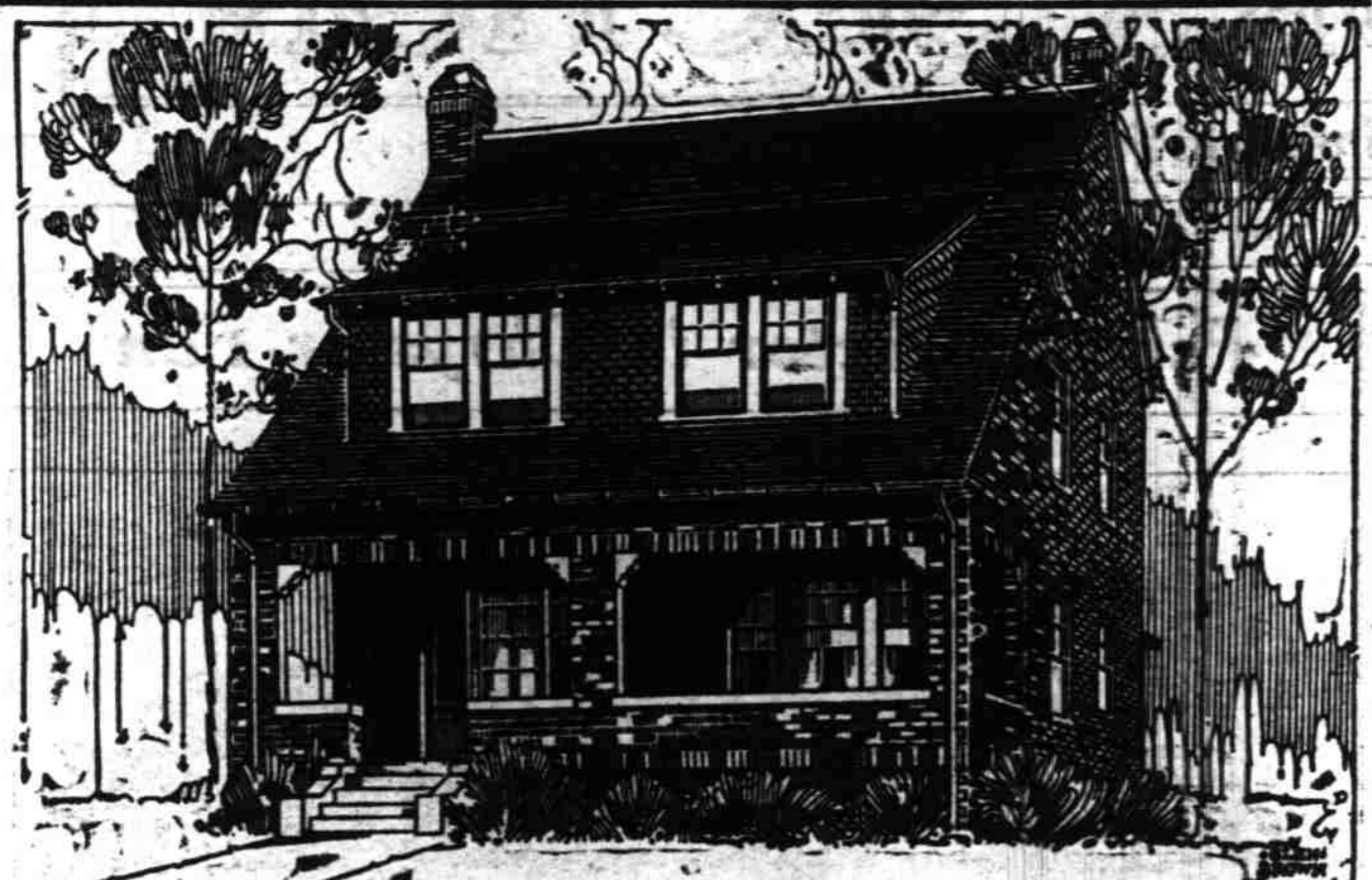
THE WATAUGA—DESIGN A710

SEMI-BUNGALOWS offer one of the most desirable types of all the smaller homes and can be built usually with as great economy as any of them.