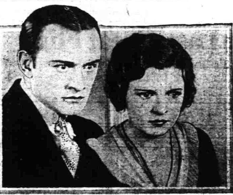
May McAvoy and Conrad Nagel featured in "Caught in the Fog" at Warner Bros. Production