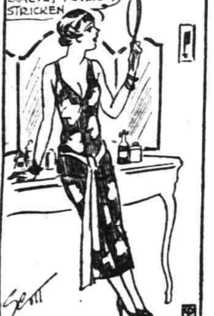
When your face is your fortune it is no crime to be poor.