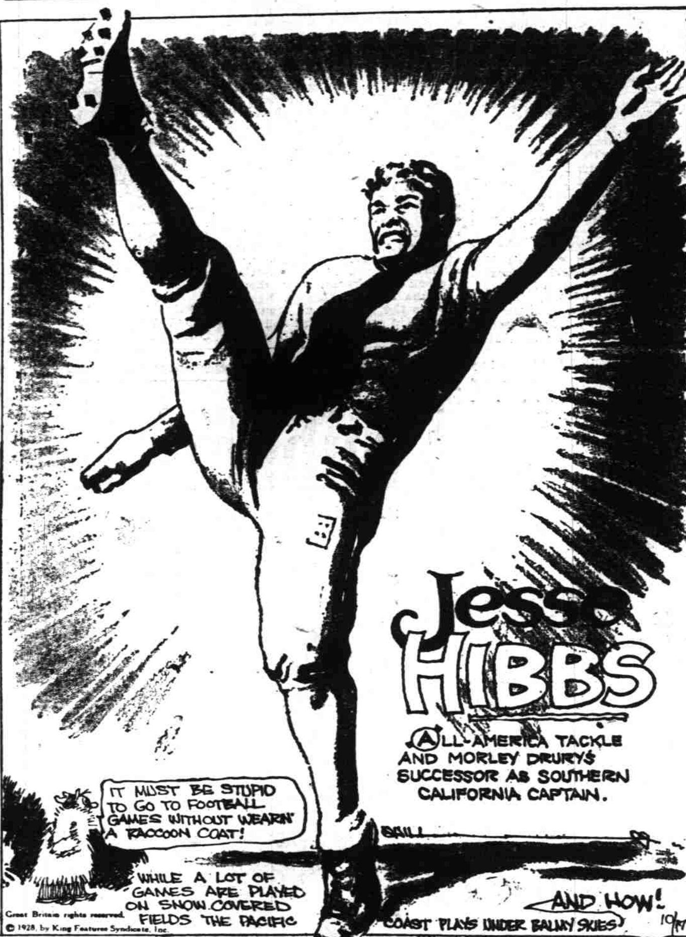
IT MUST BE STUPID TO GO TO FOOTBALL GAMES WITHOUT WEARING A RACCOON COAT! WHILE A LOT OF GAMES ARE PLAYED ON SNOW COVERED FIELDS THE PACIFIC COAST PLAYS UNDER BALMY SKIES!