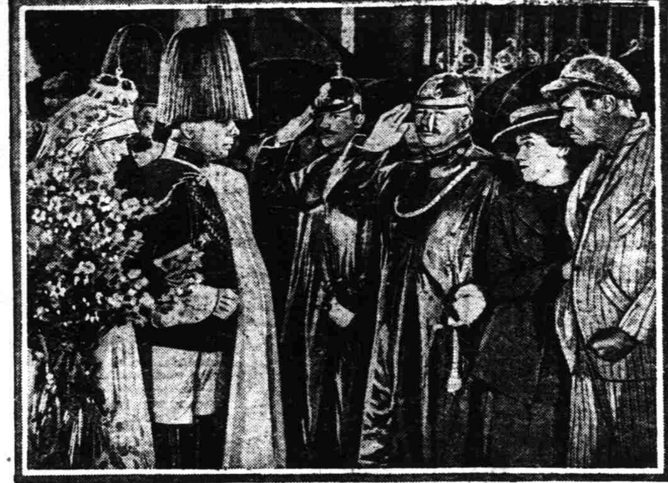
ZASU PITTS, ERICH VON STROHEIM, PAY WRAY - MATHEW BETZ IN A SCENE FROM THE ERICH VON STROHEIM PRODUCTION THE WEDDING MARCH ! A PARAMOUNT PICTURE