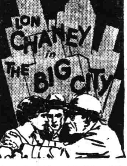
The Throbbing, thrilling Life of the Underworld