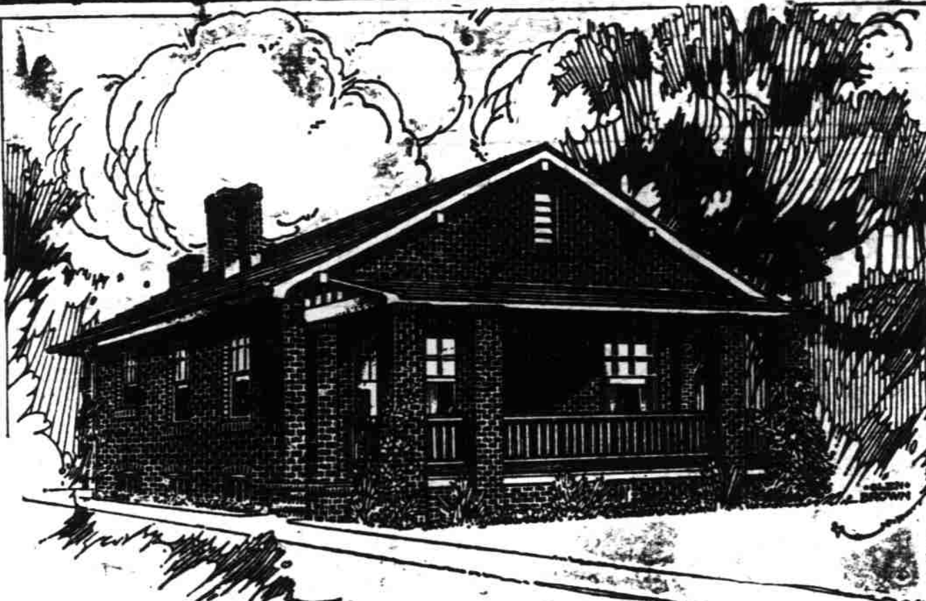
THE WINONA—DESIGN NO. 317

E LIMINATION of the dining room seems to be growing in favor in the small home, especially where it is possible to provide a cozy breakfast nook sufficiently large to accommodate four persons, the average number in a small family. There may be some danger in so doing that the prospective purchaser, in case one ever wants to sell, may not like such an arrangement, and to that degree the resale value may be impaired. But the idea is so new and has been so little tried out that it is yet problematical.